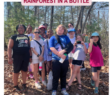
4TH GRADERS TRAVELED TO TOCCOA, GA